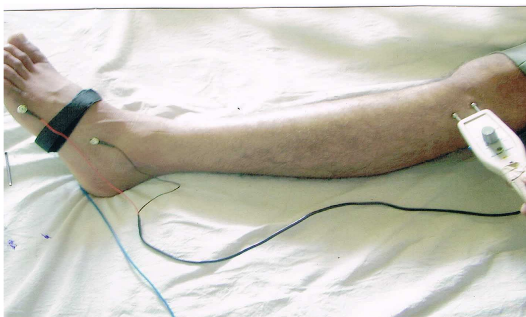
Figure 1. Electrode placements of motor CPN